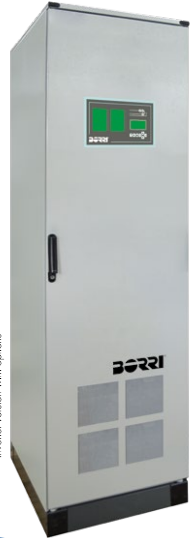
Inverter version with options

With decades of experience in industrial power solutions, Borri offers stand alone systems with robust quality and a long design life.