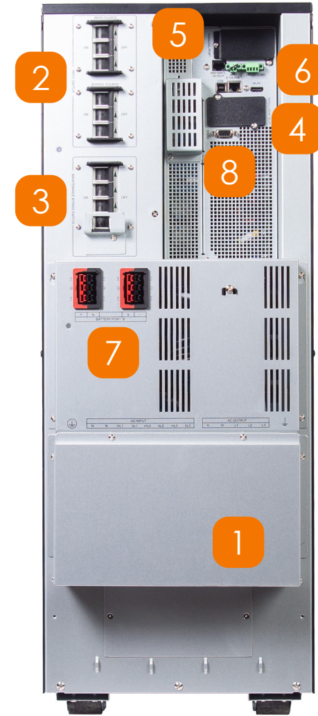
*Image shows rear of 20kVA C750

info@certaups.com 03333 130251 www.CertaUPS.com CertaUPS, Rotherside Road, Sheffield, S21 4HL